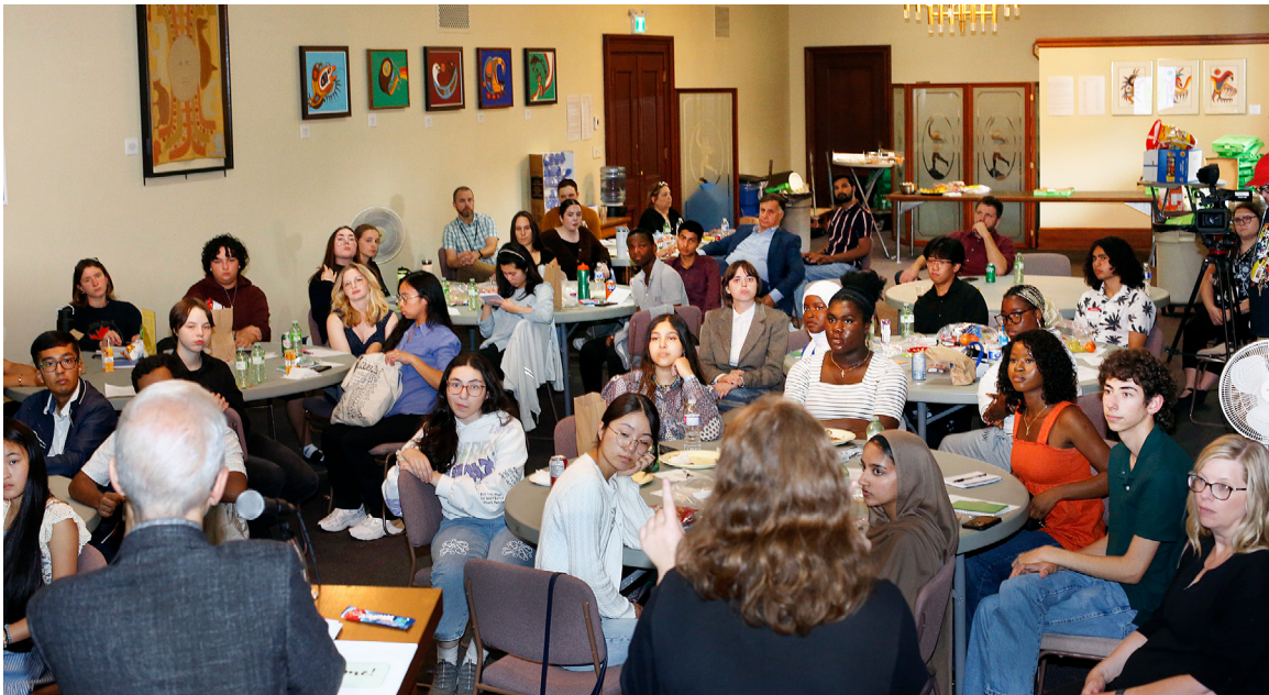
The 2023/2024 and 2024/2025 Student Advisory Council members during the August 27, 2024, in-person meeting at the Manitoba Legislature.