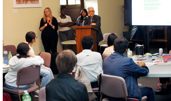
Minister Nello Altomare addressing the students in the Golden Boy room of the Manitoba Legislature.