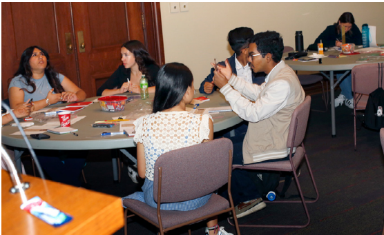
Students engaged in conversation legislature during an ice-breaker activity.