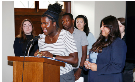
2023/2024 co-chairs along with council members presenting the annual report to the Minister.