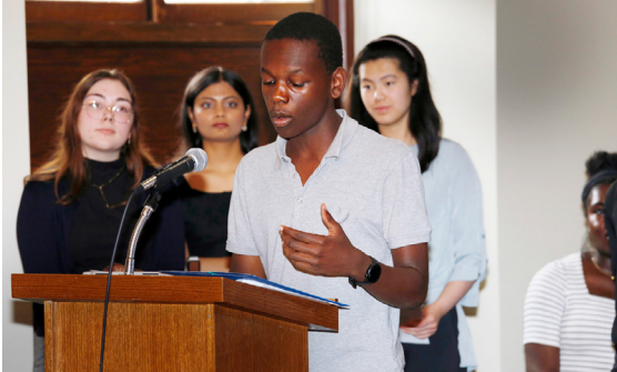
2023/2024 council members presenting the annual report to the Minister.