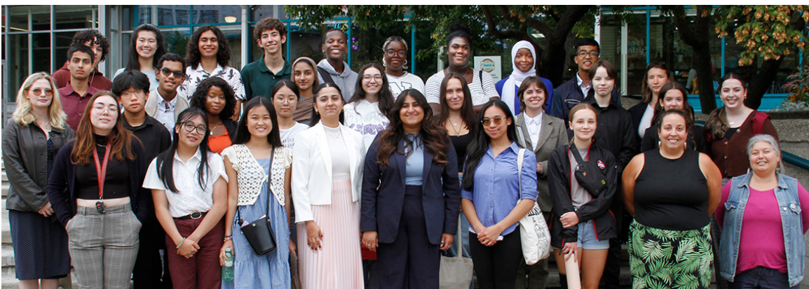
Members of the 2023/2024 and the 2024/2025 Student Advisory Council with department staff at the Forks.

Sincerely, 2023/2024 Student Advisory Council