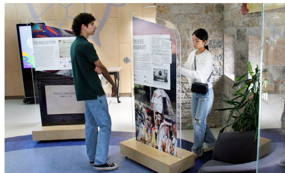
Students reflecting upon an exhibit at the Agowiidiwinan Centre.